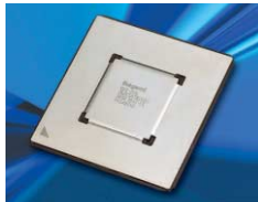
Next-generation digital process ASIC (0.18μm design rule)

End-to-end Digital processing has been realized through the use of 0.18 micro meter design rule 3.3 million gate ASIC / Fully digital stream through the camera to the HD-SDI output assures signal integrity, high picture quality, and stable and reliable operation.