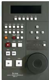
SRC-11 Remote Controller