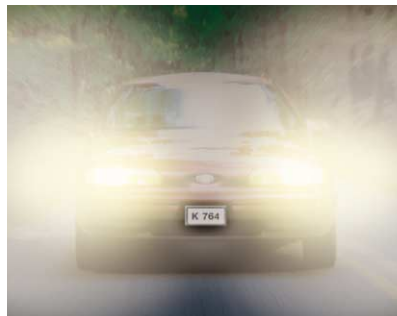
■ Spot BLC ON