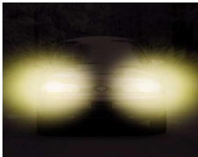
■ Spot BLC OFF

The ICD-808/808P (1/3" CCD) and ICD-828/828P (1/2" CCD) employ a high-sensitivity on-chip lens CCD. The smear level is -110dB for the ICD-808/808P, and -126dB for the ICD-828/828P. They also achieve a high sensitivity with a minimum subject illumination of 0.5 lx/F1.4 for the ICD-808/808P, and 0.15 lx/F1.4 for the ICD-828/828P. These cameras are ideally suited for outdoor surveillance, such as traffic monitoring.