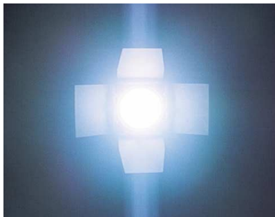
■ Conventional Models