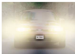
Spot BLC ON