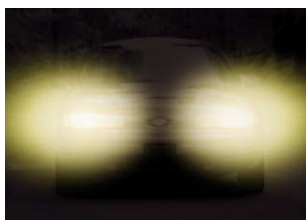
Spot BLC OFF

The camera features a high-sensitivity on-chip lens CCD to provide a smear level of -126dB. Appropriate video can be attained even when, for example, a car headlight is directly captured at night.