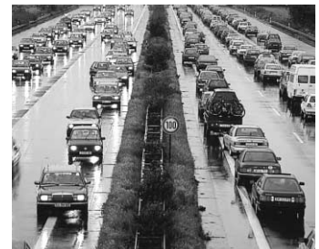
In black & white video (0.015 lx)