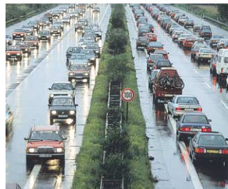
In color video (0.15lx)