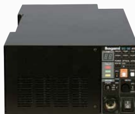
BS-98 Hybrid 2K/4K