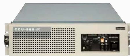
CCU-980 Hybrid 2K/4K