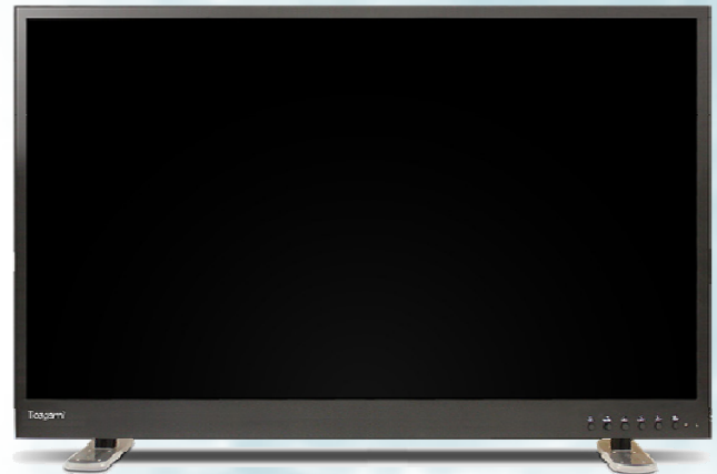
High Performance, Industrial Grade, Large Screen 32 inch CCTV LCD Monitor

The LCM-320C monitor provides flexibility and configuration selections essential in supporting your security surveillance applications.