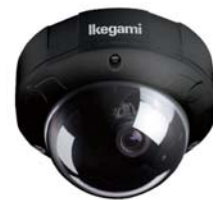
■ ISD-A35 Black Version

It is a Hyper Wide Light Dynamic Range Dome Camera that reproduces a clear and natural image even in locations where there is a significant difference in the intensity of illumination, such as window areas, or in lobby entrance of building.