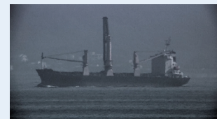
With Variable Contrast Control