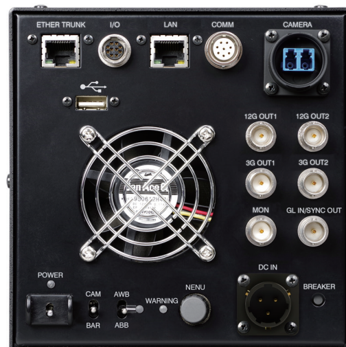
Rear Panel for CCU

Design and specifications are subject to change without notice.