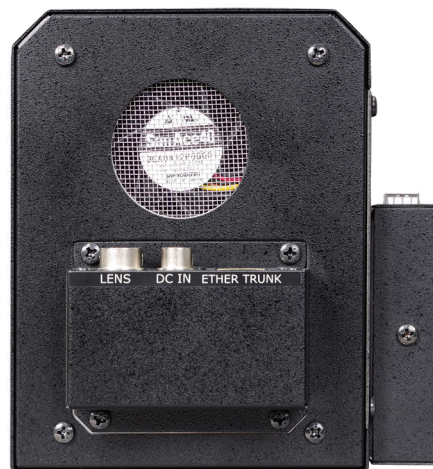
Rear Panel for Camera Head