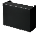
BP-960 Blank Panel for DR-960