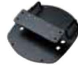
STD-960T Tilt Stand