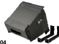
MH-904 Collapsible Hood