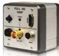
Rear Quarter View