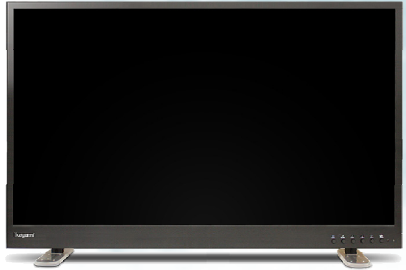
High Performance, Industrial Grade, Large Screen 42 inch CCTV LCD Monitor

The LCM-420A monitor provides flexibility and configuration selections essential in supporting your security surveillance applications